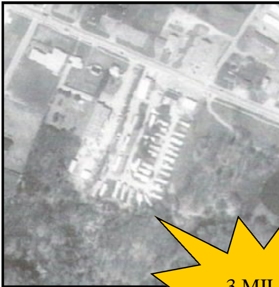
PARK VIEW MOBILE HOME PARK